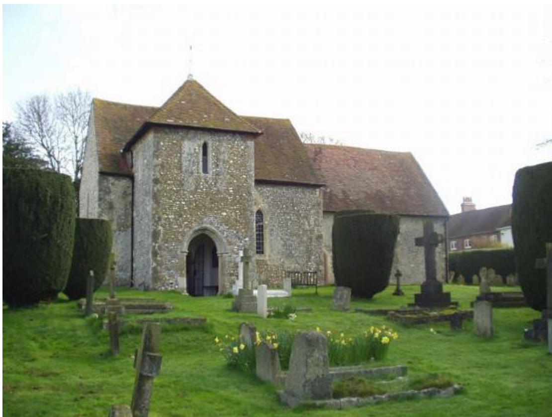
St. Andrew's Churchyard, West Stoke

St. Andrew's Churchyard, West Stoke contains 4 Commonwealth War Graves – 2 from World War 1 & 2 from World War 2.