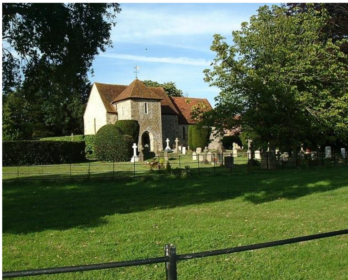
St. Andrew's Church, West Stoke